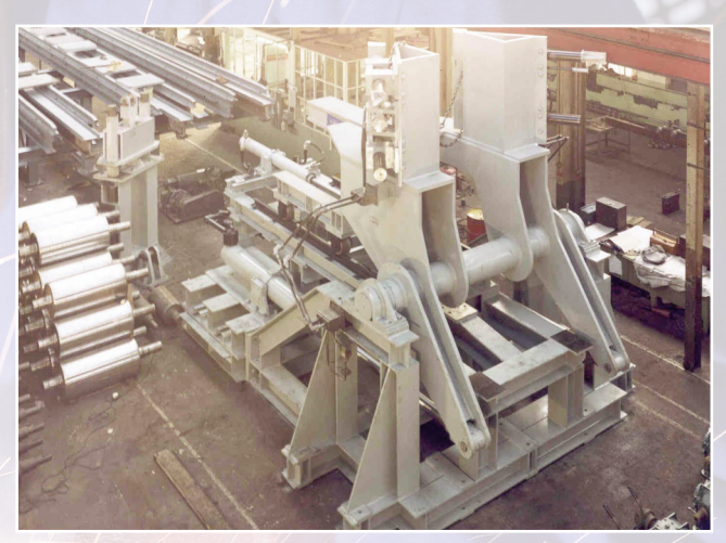
Customer: Planet Corporation Project: Grasshopper