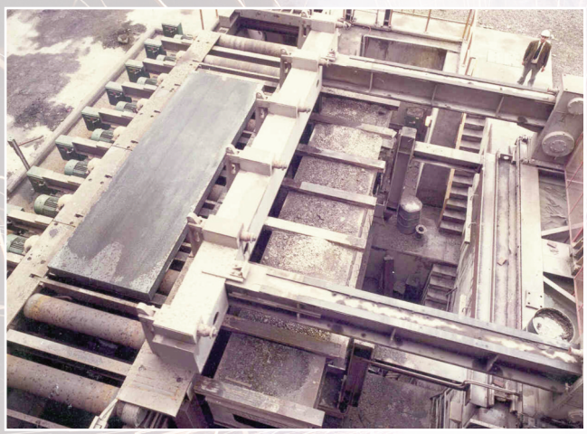
Customer: British Steel Port Talbot Project: Slab Handling Roller Table