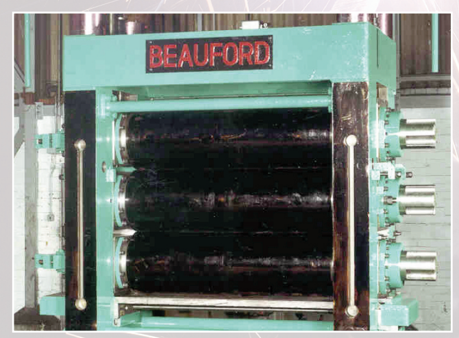
Customer: DSRM Project: 3 High Reversing Roughing Mill