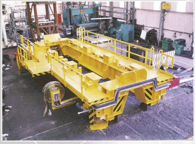
Customer: British Steel Scunthorpe Project: Tundish Transfer Car