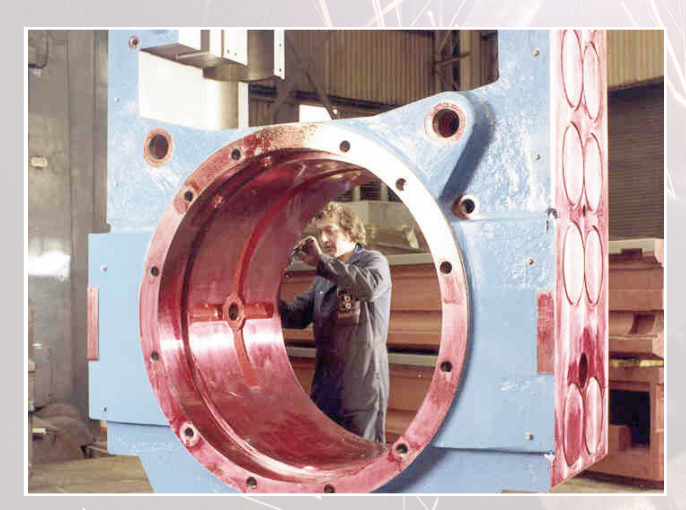
Customer: Planet Corporation Project: Coil Car

Customer: British Steel Project: Reburbished Chock